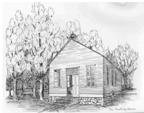
The bell on top of the New Harmony School house is now part of a monument at the LDS Ward Building in New Harmony. Its ring is as good as new.

We hope New Harmony will make this an annual event for all of us who want to visit our past .